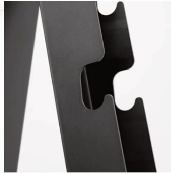
Polypropylene Covered Rack Outs To reduce noise and protect weights