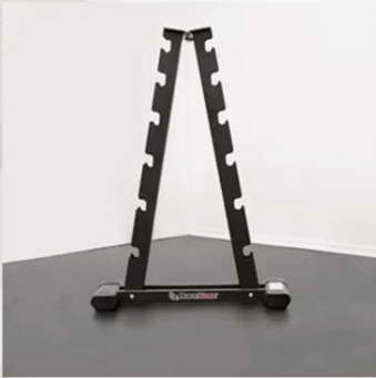
Space Efficient Vertical Design