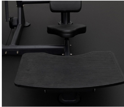
Wide Adjustable Footplate