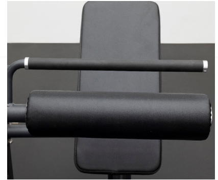
Handle Bar for Support