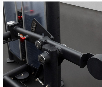
5 Point Adjustable Height