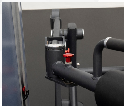
Swinging Arm for Easy Access