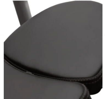
Ergonomic Headrest For head and neck comfort