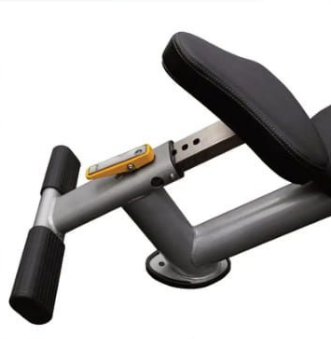
Adjustable Seat Height 6 Adjustment points