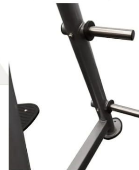
4 Weight Plate Storage Pegs