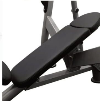
45 Degree Position For optimal upper chest targeting