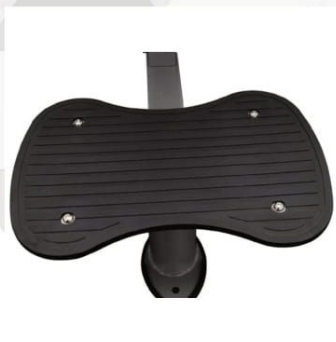
Spotter Platform with Rubber Grip Padding For safety