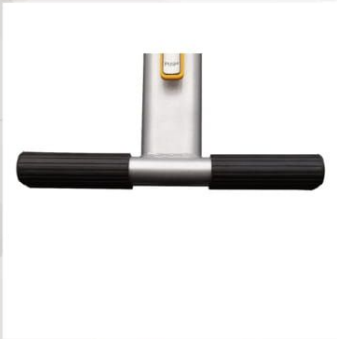
Foot Rest For stability during the exercise